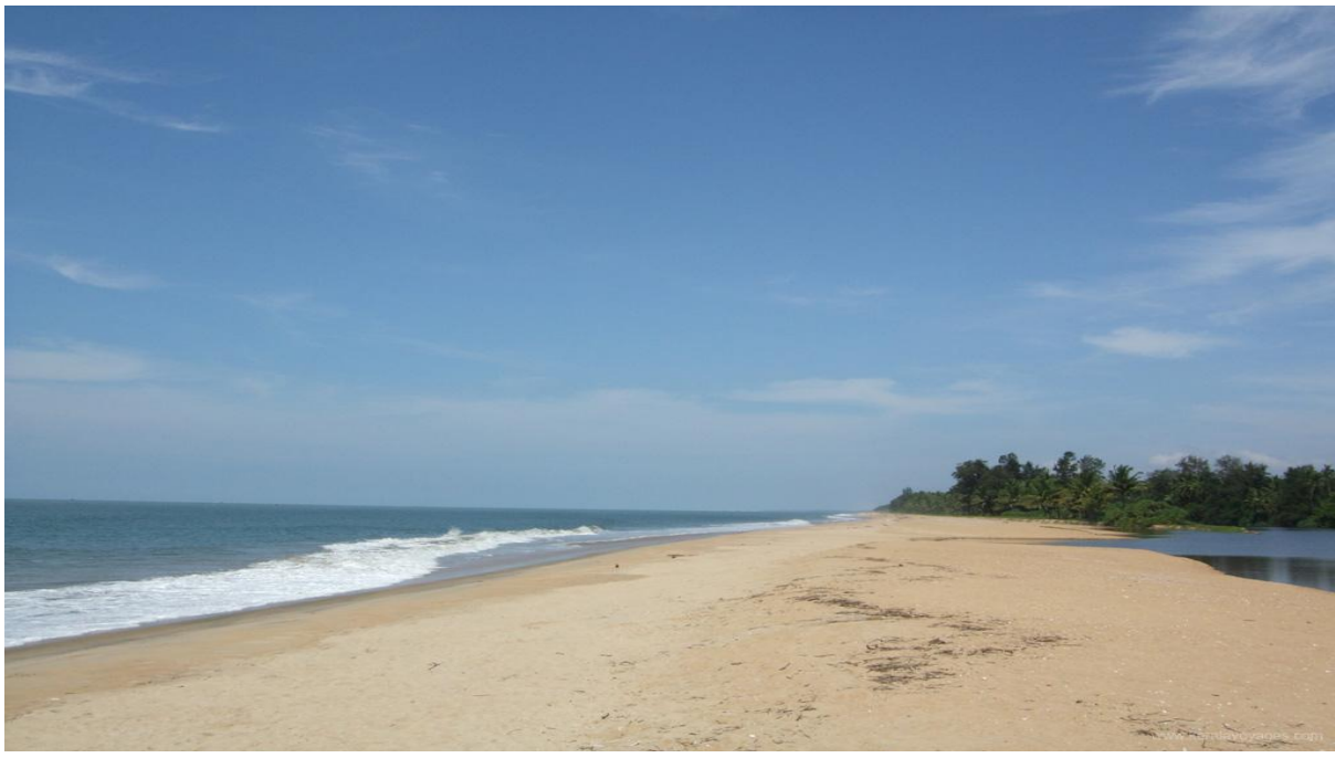
Day 14: Nileshwar toKannur or Mangalore Airport

Early morning walk can be organized along the beach in the fishermen village.After breakfast, head to the beautiful fishermen village of Nileshwarto experience Toddy Tapping and the daily life course of the villagers like Coconut Husking, Fishing etc. You will also be taken Nileshwar town for a Beedi Making and Handloom Experiences.Overnight at Nileswaram.